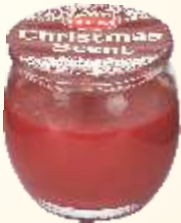
Christmas Scent 1.5oz