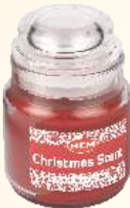
Christmas Scent 3oz

Unlock the pretty metal boxes with elegant aromas. These candles are an invitation to the world of delight. They will perfume and decorate your space while you travel or while you relax at home.