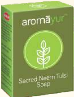
Sacred Neem Tulsi

Aromayur Soap is ayurvedic blend of fragrant herb & flower powders, organic shea butter, coconut oil and natural aloe vera extract in soap base. Richly evocative with refreshing aroma, this soap leaves you with soft, nourished skin.